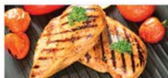
Boneless Skinless Chicken Breasts 10.99 Lb.