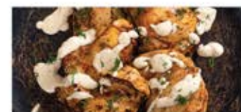
Boneless Marinated Chicken Thighs 11.99 Lb.

These hot prices are effective Wednesday, February 4, through Tuesday, March 3, 2026.