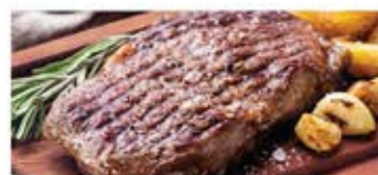
Boneless Beef Ribeye Steak 27.99 Lb.