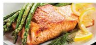
Scottish Salmon Fillet 20.99 Lb.