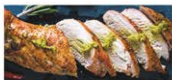
Berkshire Pork Tenderloin 17.99 Lb.