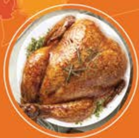
Willie Bird Turkey Choose from Original, Organic or Smoked.

ALL ORDERS MUST BE PLACED BY SATURDAY, NOVEMBER 23, 2024