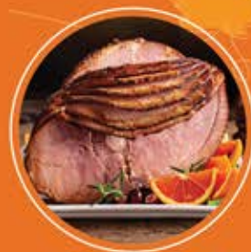
Niman Ranch Spiral Honey Ham Free range, no nitrates.

Thanksgiving Day: 7:30am-3pm • Black Friday: 8am-7pm