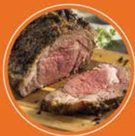
Prime Rib in the Bag Prepped and ready to cook!