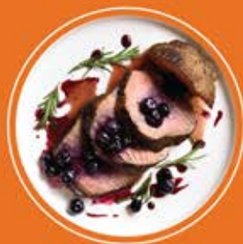
Zanutto's Italian Style Filet Mignon Roast