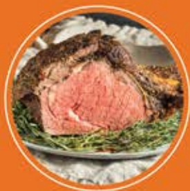
Zanutto's Prime Rib Certified Piedmontese Beef.